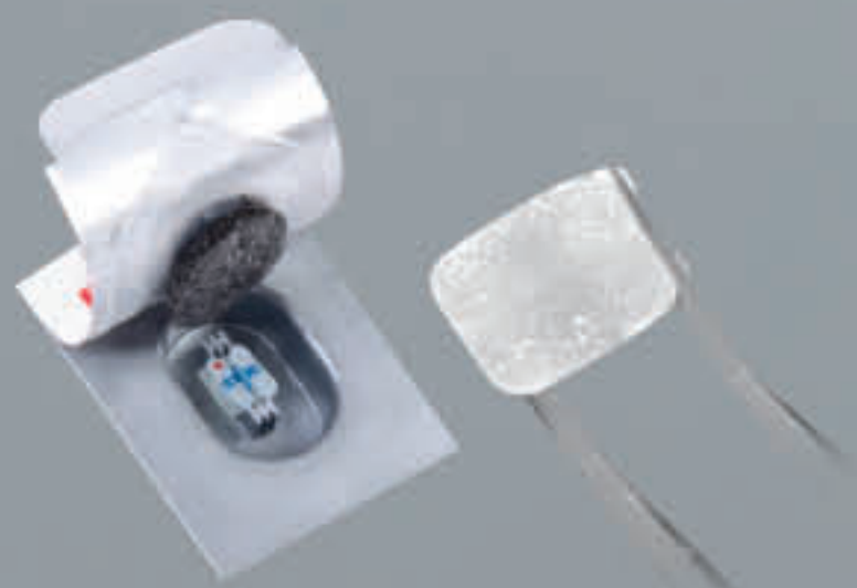
3M™ APC™ Flash-Free Adhesive Coated Appliance System

Performance and aesthetics that exceed the expectations.