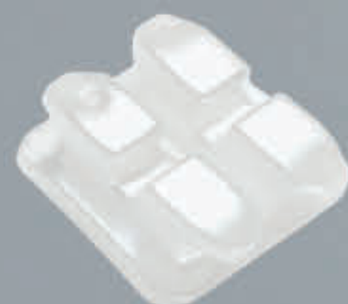
3M™ Clarity™ Advanced Ceramic Braces