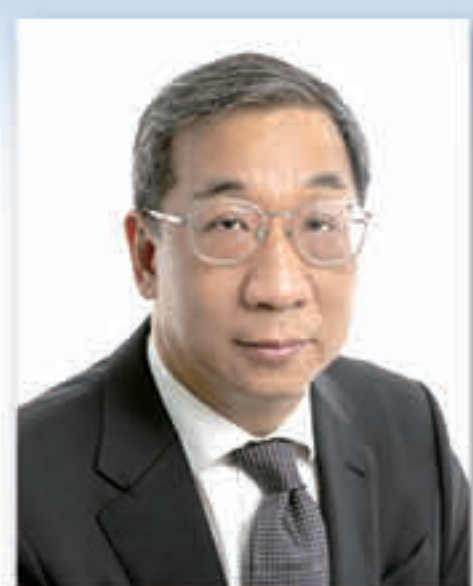
香港牙醫管理委員會主席 李健民牙科醫生太平紳士