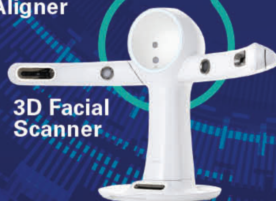
3D Facial Scanner