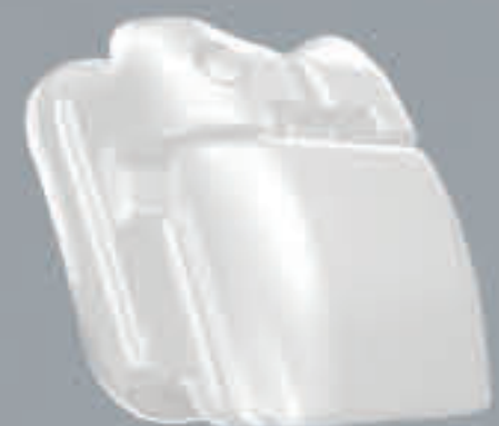
3M™ Clarity™ Ultra Self-ligating Braces